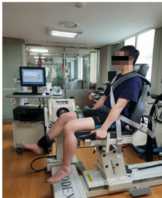
Figure 1. Isokinetic Biodex System 4 muscle peak moment measurement.

The number of participants for each group was calculated using G-Power version 3.1 (University of Dusseldorf,