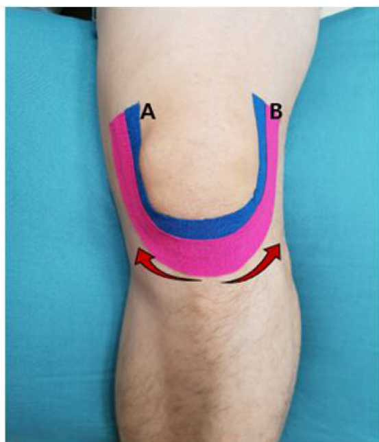
Figure 3. Horseshoe taping for patellar superior gliding.