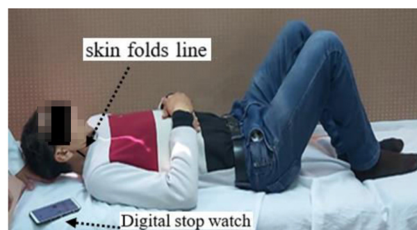
Figure 1. Isometric neck flexor muscle endurance test for induction of cervical flexor fatigue. The subject elevated his head up with the therapist's hand under his head. The neck arrow points to the skin-folds line drawn by the therapist and the small arrow points to the digital stopwatch for measuring the time of fatigue.

The subject was asked to sit with back support & the foot was placed supported on the floor with knee and hip at 90°. The Target paper of the test was fixed on the wall about 90 cm from the subject's seat & it was adjusted according to the height of the subject. The laser pointer was fixed on the highest point of the subject head (Figure 2). The subject was asked to fix his/her head at the center of target paper, initially with opened eyes to become familiar with the test, then the subject was asked to move his/her head in four directions to the right, left, upward & downward as much as