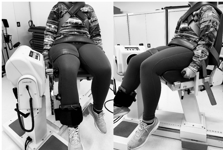
Figure 1. Positioning of the participant for isokinetic testing on the Biodex System 4 ergometer.

scheduled within 2 hours of the time that the early-follicular phase visit was performed. Additionally, participants were asked to refrain from moderate or vigorous physical activity for 24 hours prior to the visit. Participants completed a 24-hour diet record using the ASA 24 (NIH, National Cancer Institute, Bethesda, MD) prior to each visit to ensure that dietary factors that may influence grip strength or isokinetic torque production were not different among visits. Finally, participants were asked to complete a menstrual symptom questionnaire at each visit to capture symptoms they may experience that could be attributed to their menstrual cycle. The instrument asked about musculoskeletal as well as psychological symptoms that may occur throughout the menstrual cycle.