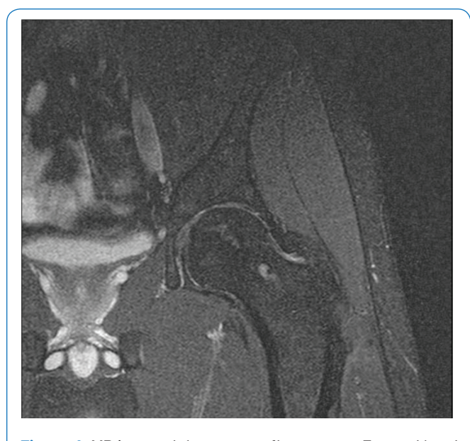
Figure 4. MR images taken a year after surgery. Femoral head maintained its sphericity, bone marrow edema subsided and bone graft integration was achieved.

In theatre, under general anesthesia, the patient was put in supine position. Hip arthroscopy preceded in order to assess the congruency of the hip joint and the integrity of the femoral head. After the integrity of the femoral head was verified, an incision of approximately 2 cm was made over the ipsilateral anterior iliac crest. A small trocar was inserted multiple times into the ilium and unicortical bone autograft was harvested. Then, a 1 cm incision was made on the side of the left femur extending distal to the vastus ridge. With the assistance of fluoroscopy, a guide wire was inserted above the level of the lesser trochanter pointing towards the necrotic lesion. When anterior and lateral views confirmed it was directed