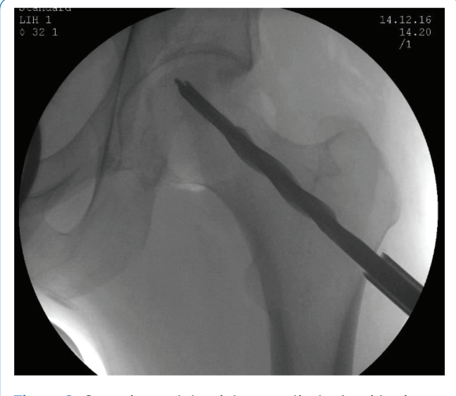
Figure 3. C-arm image taken intraoperatively. A guide pin was forwarded to the site of osteonecrosis and reaming commenced.

transient osteoporosis and avascular necrosis. The plan was to keep the patient non-weight bearing and arrange a full review after a period of 4 weeks. During that period no clinical improvement was noted, while pain management with NSAIDs was not effective. New MR images taken 30 days later, revealed diffuse bone marrow edema at the femoral neck, linear subchondral bone abnormalities and subtle collapse of the femoral head superolaterally as shown in Figure 2 (Steinberg stage 3<sup>25</sup>). These findings were consistent with avascular necrosis of the left femoral head, while no additional defects of the acetabulum were noted.