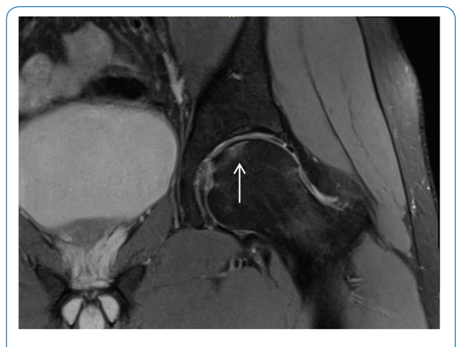
Figure 2. New MR images taken a month after the patient remained non-weight bearing. Subchondral abnormalities and bone marrow edema are evident (arrow mark).

After a thorough literature search we found only one study